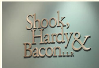
Shook, Hardy & Bacon in Miami.